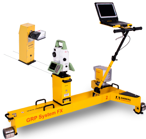
Front: Amberg IMS 1000 with tachymeter Back: Profiler 120 FX for Amberg IMS 3000