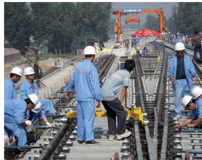
Precise and fast turnout positioning with the aid of the precise and robust measuring system GRP 1000.