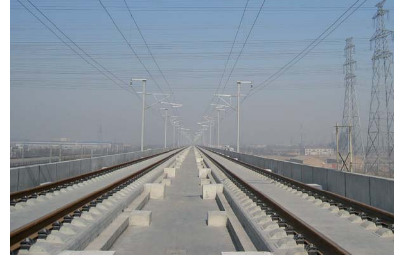
New high-speed line section Beijing-Tianjin, China, ready for the Olympic Games in August 2008.