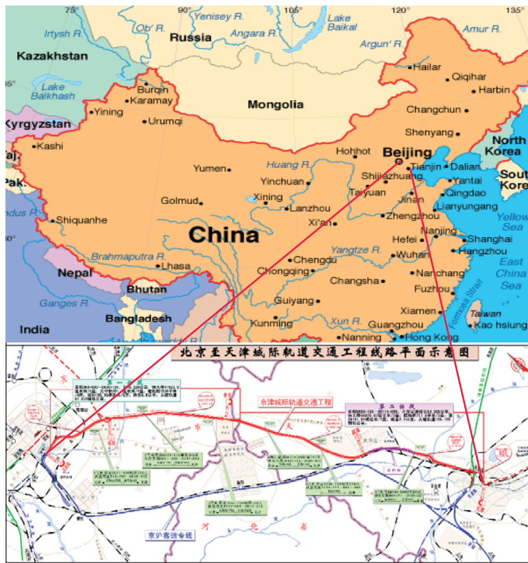
Thanks to the new high-speed line, the travel time from Beijing to Tianjin is only 30 minutes.

For the first time, Chinese building contractors have used modern Swiss surveying technology for track building. The surveying task involved high-precision positioning of 24 high-speed turnouts and complete geometric acceptance surveys of the high-speed section between Beijing and Tianjin.