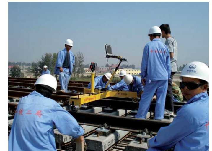
Automatic correction data in real time - low error rate, high performance and excellent track quality.

Precise measuring with GRP 1000 provides a basis for immediate release of subsequent processes (e.g. track slab concreting work). This helps prevent incorrect positioning of points. (It is not possible to correct the position of points once they have been concreted without expensive and time-consuming dismantling.) Final track acceptance using the Slab Track software serves the purpose of quality control and as the building contractor’s documentation for the client. The results of the analyses with regard to deviations of position and relevant track geometry criteria are an important addition to acceptance of dynamic behaviour using track surveying vehicles.